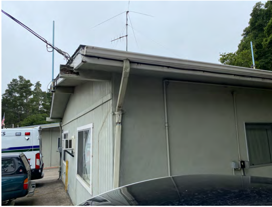
Photo 14- White Wood Door Casing- 2535 Main St.- Exterior- Lead-Containing Paint (Good Condition)