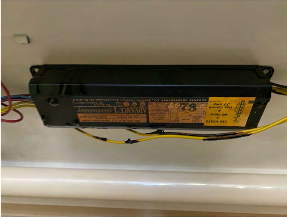
Photo 16- Mercury-Containing Light Tubes in Light Fixtures- 2515 & 2535 Main St.- Throughout Area