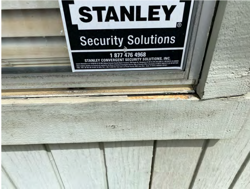
Photo 10- White Wood Fascia- 2515 Main St.- Exterior- Lead-Containing Paint (Good Condition)