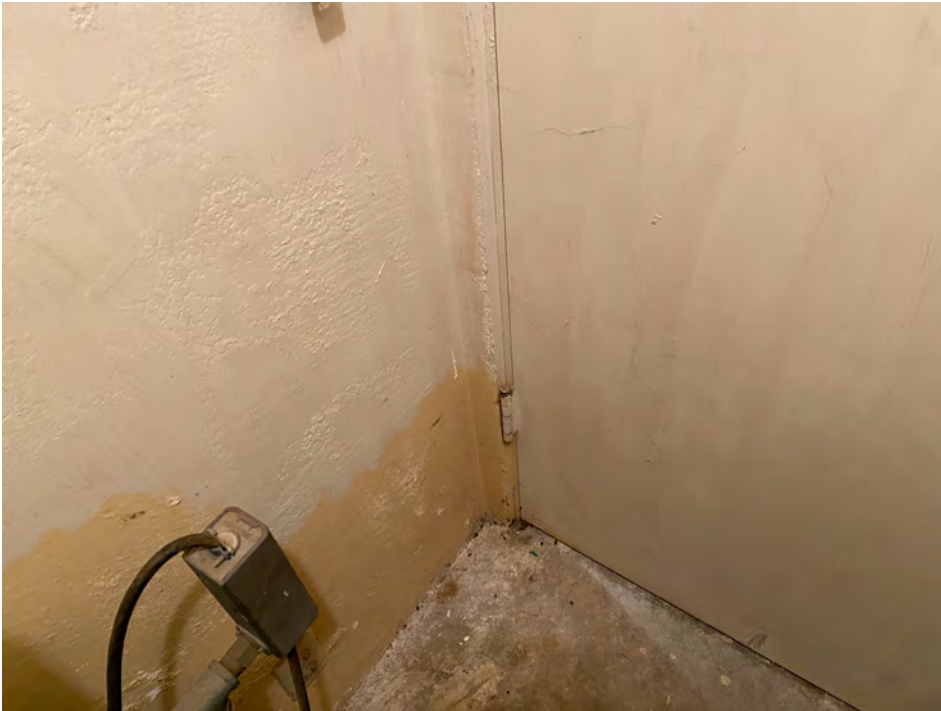
Photo 12- White Plaster Walls, White Wood Door & Casing- 2515 Main St.- CHC Area- Lead-Containing Paint & LBP (Good Condition)